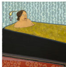
It's Not Dry Yet