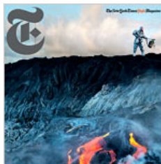
T Magazine: Travel Issue, Spring 2010