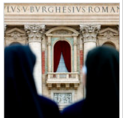
At the Vatican, Up Against the World