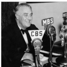
With Justices for All